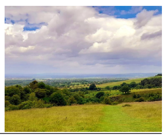
Page 4 HotPott – Summer 2022