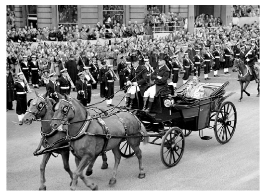
Queen of Tonga, Coronation

... It was grand to hear the public joining in with the service. The Abbey ceremony ended and the atmosphere became tense. It is difficult to express one's feelings but a thrill of expectancy seemed to ripple through the crowd as we waited. The tumultuous cheering in the distance got louder and we knew the procession was coming nearer. The troops of our Home and Commonwealth Forces were superb... The band of men that caught my eye were undoubtedly the Mounties. The resplendent Queen of Tonga, though she