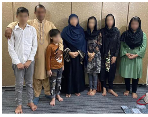
Afghan Christians forced to flee