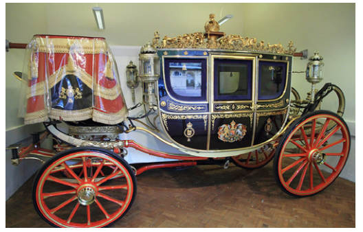
Irish State Coach