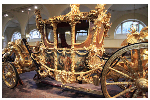
Gold State Coach

must have been soaked to the skin driving through the steady downpour in an open coach, appeared to be thoroughly enjoying every moment of it. She waved gaily to the crowds on both sides and had a wonderful reception.