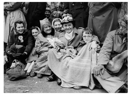
Coronation crowds; the Guardian

behaved crowd and its spirit was transmitted to all. It was alert to every incident and expressed its feelings volubly on every conceivable occasion. A loud cheer hailed the two brief appearances of the sun, which occurred between prolonged and heavy rainfalls at the beginning of the procession, imparting to the colourful uniforms a sparkle and brilliance that only the sun could give.