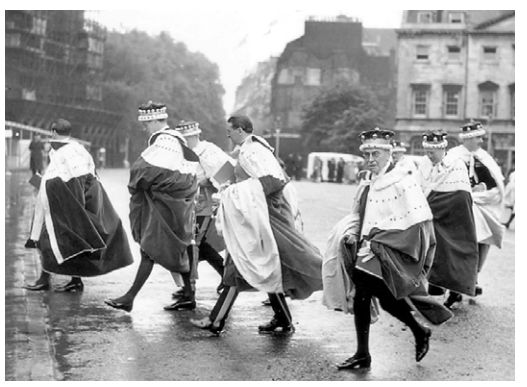
Peers going to the Coronation; the Telegraph earth do dwell.

The relay of the service from the Abbey was excellent, and everyone appreciated being able to share in this way in the actual Coronation ceremony. One was struck by the quietness which fell upon the crowd and the way in which everyone joined in the relevant parts of the service and, all standing, sang with real fervour the hymn All people that on