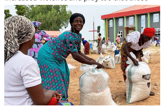
Aid for Christians, Kaduna State, Nigeria; Barnabas

opening fire; as the perpetrators did not wear masks no one suspected they were armed until they heard shots. The Ondo State Governor wept as he visited the church in the hours following the attack, commenting: 'Our peace and tranquillity have been attacked by the enemies of the people.' The Bishop of Ondo Diocese described the attack as 'madness... It is quite unbelievable that somebody will come and the intention is to kill everybody in that church.' Over the past few years Nigeria, particularly in its Middle Belt, has experienced an upsurge in violence and kidnappings; Ondo is regarded as one of Nigeria's most peaceful states, where violence against Christians is rare. However, violence is spreading not only to Ondo but also to Abia, where the head of the Nigerian Methodist Church and two of his colleagues were kidnapped recently, though they were released a short while later. Please pray for our Lord Jesus to draw close to those who have been injured or made anxious by the increased violence and pray too that those