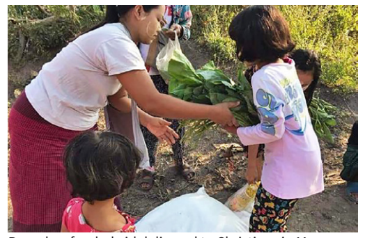
Barnabas funded aid delivered to Christians in Myanmar